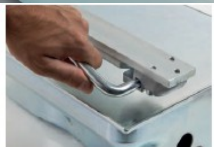
Manual release system